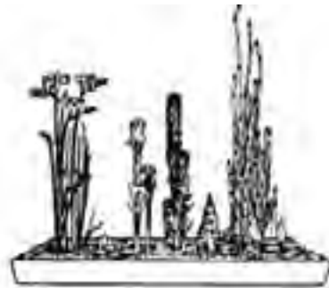
parallel design a design in 1 container with 3 or more groupings placed in a line